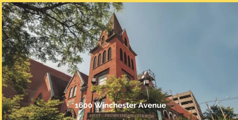
1600 Winchester Avenue

*For special rate request room under First Presbyterian Church.